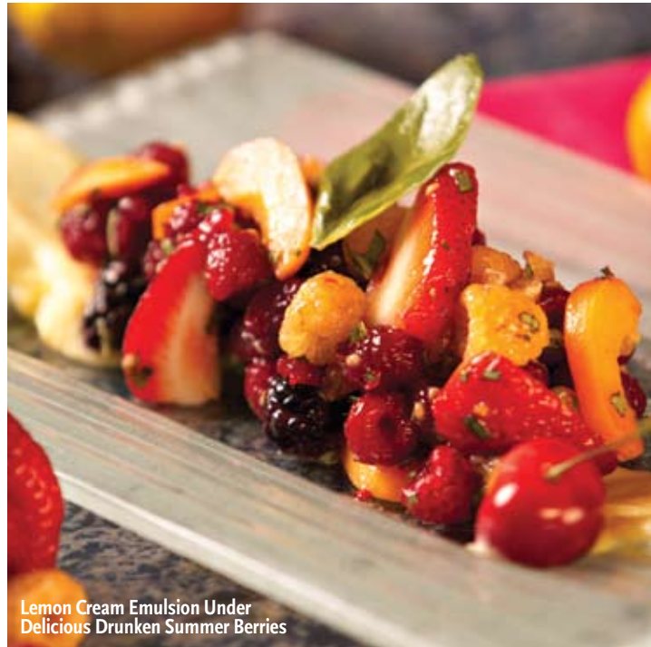
Lemon Cream Emulsion Under Delicious Drunken Summer Berries

It's the best dish you've ever eaten, and you're from out of town. The only way to have it again is to make it yourself. So, you follow your subtle foodie instincts and casually request the recipe. You'd even buy the restaurant's recipe book if they have one, you say. The waiter laughs you out of the establishment. No way are they giving up their secrets. But never fear — there's a trick.