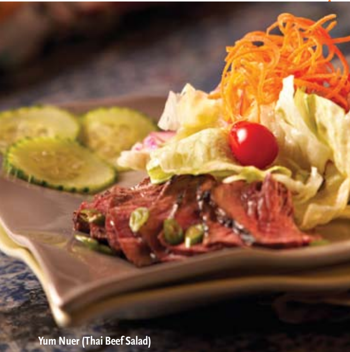
Yum Nuer (Thai Beef Salad)

suggests. The more diverse your experiences, the better you'll be at breaking down recipes from those stubborn chefs who just won't give 'em up.